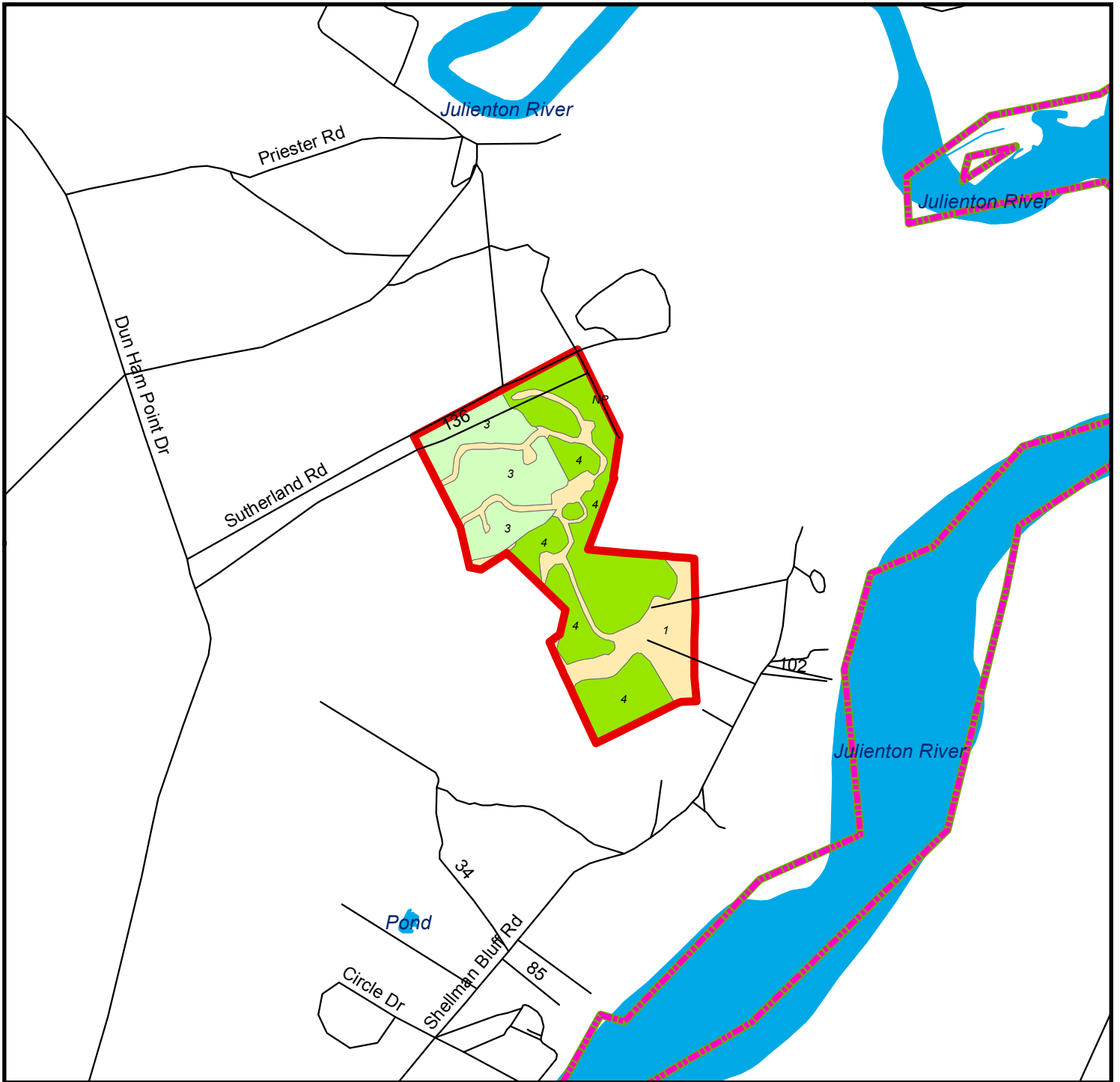
Stand Map 113C - Pyramid - Tract 4 Parcel # 13191Hb009 McIntosh County, GA - approx. 128 acres +/-